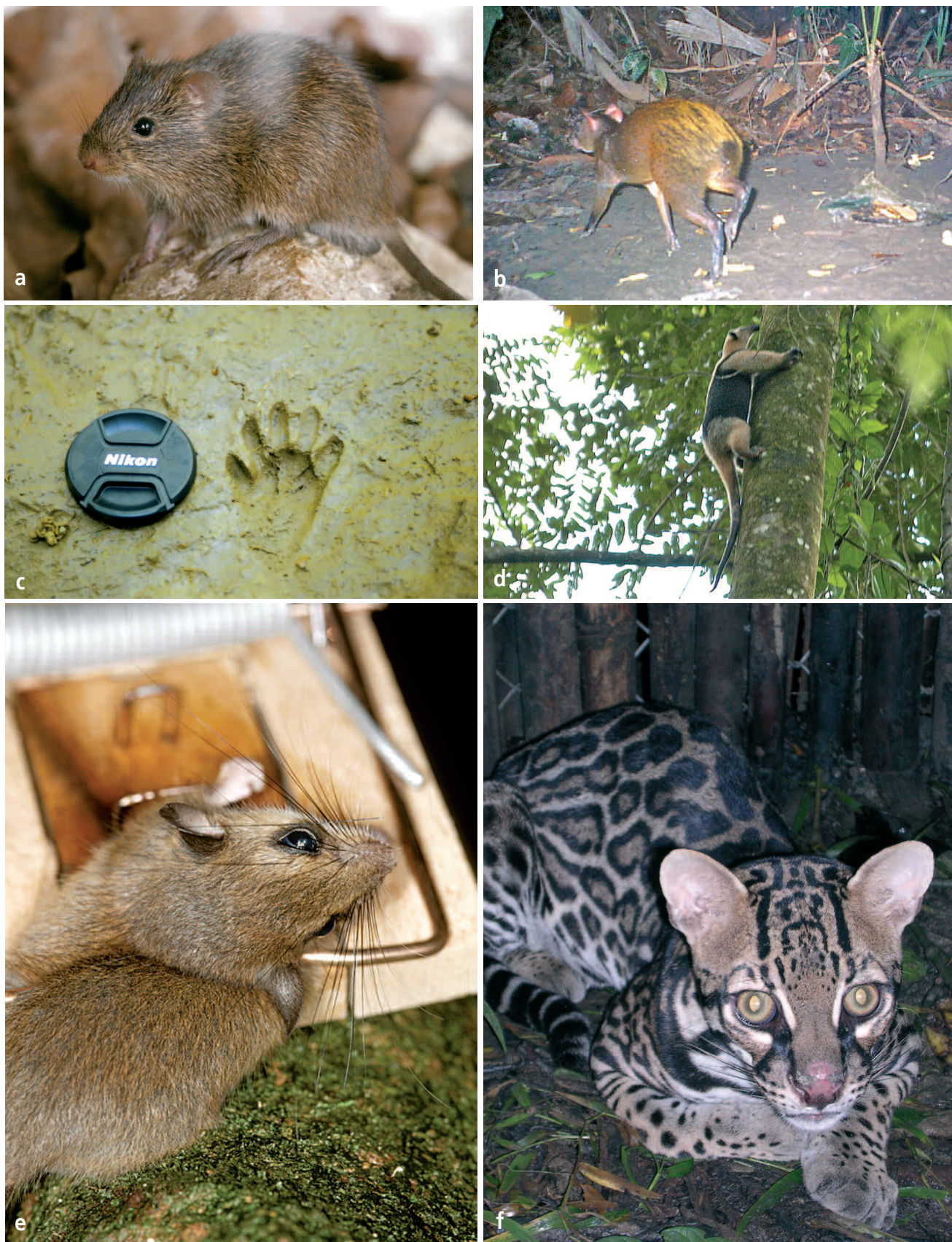
Fig. 2: A selection of mammals “captured” with sampling methods shown in Fig. 1. From upper left to bottom right: (a) Sigmodon hispidus (live-capture – La Gamba); (b) Dasyprocta punctata (“caught” by a cam-tracker in primary forest); (c) Procyon lotor – track; (d) Tamandua mexicana spotted on Virola spp., Myrsiticaceae (primary ridge forest); (e) Nyctomis sumichrasti (snap-trapped in secondary forest, (f) Leopardus pardalis (cage-trapped in primary forest).