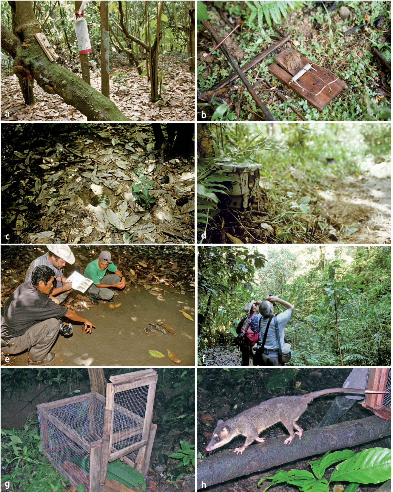
Fig. 1: Methods applied for sampling data about mammals of the Piedras Blancas National Park. From upper left to bottom right: (a) arboreal rat-sized snap-trap; (b) mouse-sized bottom-trap impaired by earth mounds of ants; (c) bucket-trap in an abandoned cocoa plantation; (d) cam-tracker installed at a game pass near the forest edge; (e) track identification lessons with local experts (J. Angel, V. Garcia with CW) at a scent station; (f) visual search for mammals often turns out to be a neck-stretching and frustrating exercise in rainforest habitats (AL & CW); (g) self-constructed trapdoor-cage; (h) juvenile Philander opossum released from such a cage trap.